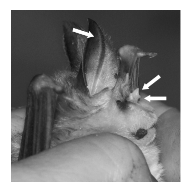
\label{eq:Figure 3-Profile view: the sella's upper connecting process is relatively blunt in profile, only slightly longer than the lower.