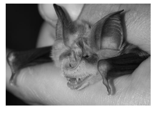
Figure 2 – Shape of R. mehelyi nose-leaf: the lancet narrows sharply in its upper half; note the dark mask surrounding the eyes.